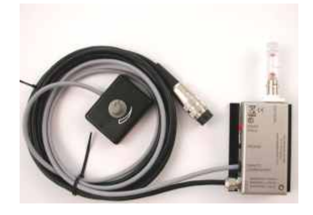
SEC low-noise headstage with electrode holder