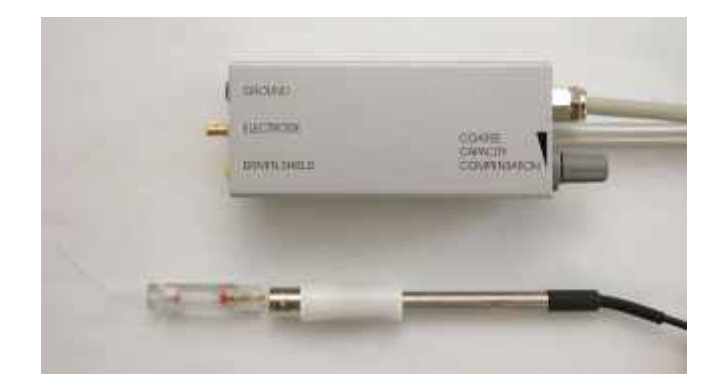
SEC standard headstage with electrode holder and adapter