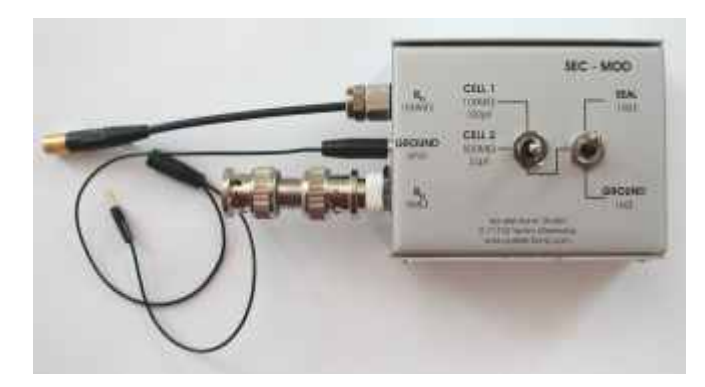
SEC passive cell model